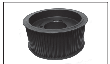
For 8 mm POWERHOUSE™ HTD® pitch timing pulleys, see page 110.